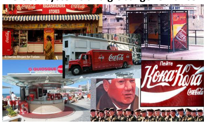
Paper 2 Global systems and global governance