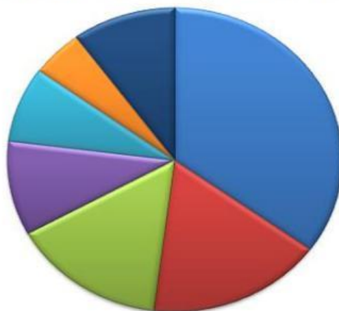
Market share in the UK supermarket industry

TASK: The pie chart below shows what % of the market the 6 biggest UK supermarket chains control. Use your existing knowledge of the industry to try and identify which segment of the chart represents which supermarket chain. 10% of the chart can just be labelled 'other'.