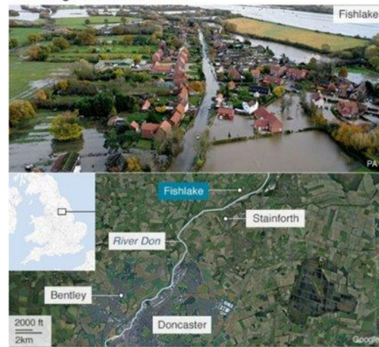
Fishlake is one of the towns worst affected by flooding on the River Don

In 2019 the village of Fishlake in South Yorkshire suffered extensive flooding. Some residents in the flood-stricken village were out of their homes for up to three weeks as efforts were made to make the area safe.